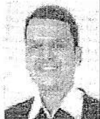
Shri. Devendra Fadnavis Hon'ble Chief Minister of Maharashtra