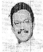
Shri. Vinod Tawde Hon'ble Minister of Higher & Technical Education, Govt. of Maharashtra