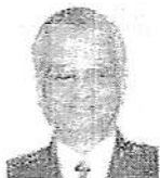
Dr. Anil Kakodkar Padma Vibhushan Eminent Scientist (Atomic Energy)