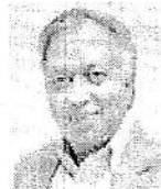
Dr. Vijay Bhatkar Padma Bhushan Chancellor, Nalanda University Eminent Computer Scientist