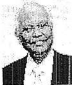
Dr. R. A. Mashelkar Padma Vibhushan National Research Professor Eminent Scientist